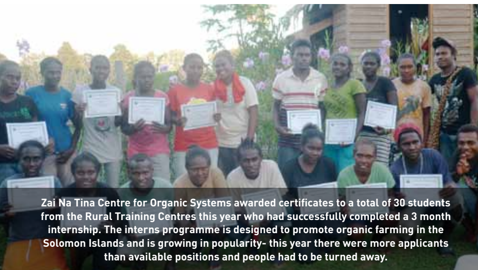
Zai Na Tina Centre for Organic Systems awarded certificates to a total of 30 students from the Rural Training Centres this year who had successfully completed a 3 month internship. The interns programme is designed to promote organic farming in the Solomon Islands and is growing in popularity- this year there were more applicants than available positions and people had to be turned away.

Successful implementation of projects currently in the process of review by potential donors will assist POETCom to develop a sound track record of project implementation and facilitate future resource mobilization efforts.