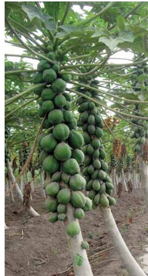
It is usually assumed that farmers' income from growing organic products will be higher because the prices they receive for these products will be higher. Yet, little or no research has been undertaken on the economics of organic agriculture in the Pacific islands. Natures Way Cooperative Fiji Ltd through funding from ACIAR has undertaken 3 years of in-field research that explores the economics of organic agriculture, with the case of Fiji papaya and results are promising for organic production.