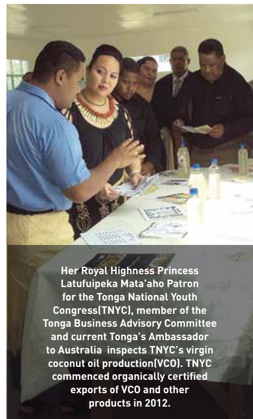
Her Royal Highness Princess Latufuipeka Mata'aho Patron for the Tonga National Youth Congress(TNYC), member of the Tonga Business Advisory Committee and current Tonga's Ambassador to Australia inspects TNYC's virgin coconut oil production(VCO). TNYC commenced organically certified exports of VCO and other products in 2012.