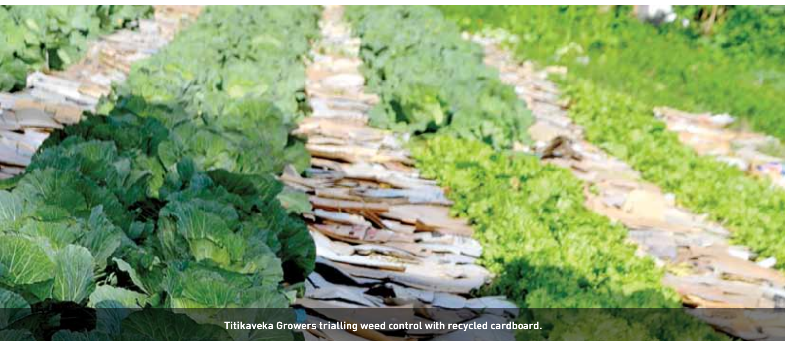
Titikaveka Growers trialling weed control with recycled cardboard.

Currently two options exist for organic certification in the region- Participatory Guarantee Systems (PGS) and third party certification. PGS are a low cost system to provide a guarantee of organic integrity of a product for local market. The first Pacific PGS was established in New Caledonia and approved by POETCom to use the “Organic Pasifika” mark in 2010 and the second, ‘Bio Fetia’ was approved in July 2012 for French