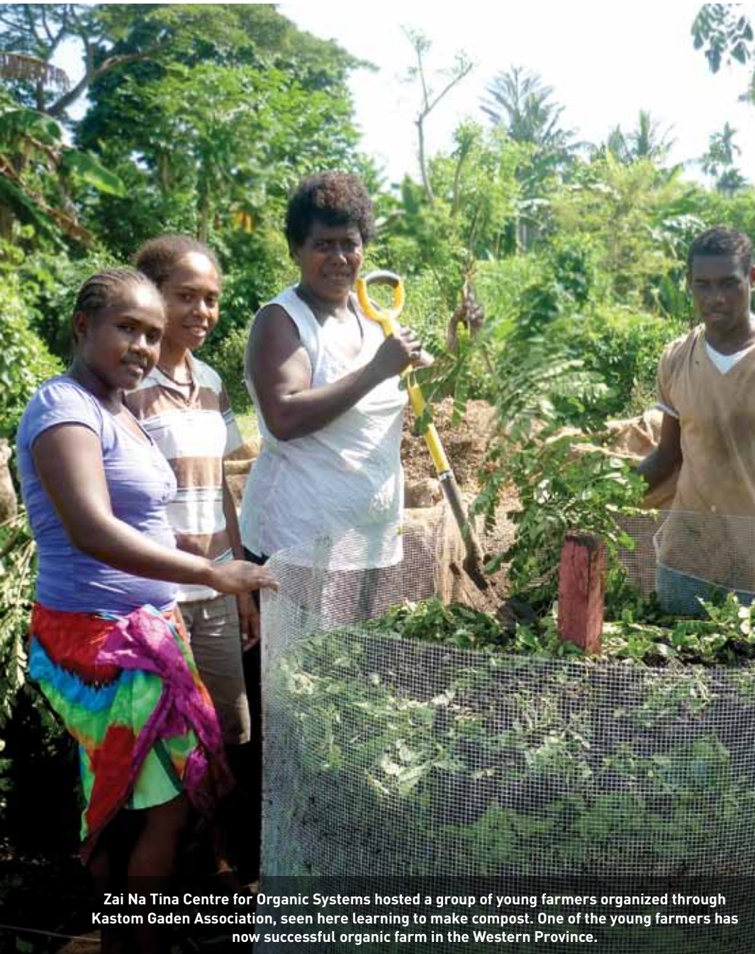
Zai Na Tina Centre for Organic Systems hosted a group of young farmers organized through Kastom Gaden Association, seen here learning to make compost. One of the young farmers has now successful organic farm in the Western Province.