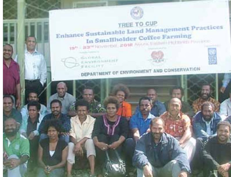
Training in PNG sponsored by UNDP through the Department of Environment and Conservation to improve organic management practices for coffee growers. The IFOAM Training Manual for organic agriculture was utilised in developing the training course.