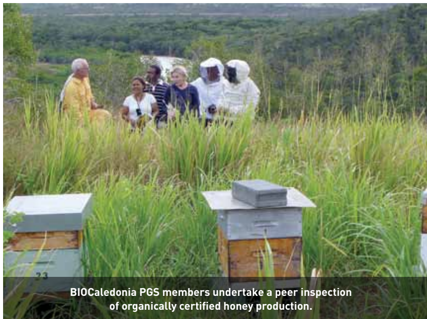
BIOCaledonia PGS members undertake a peer inspection of organically certified honey production.