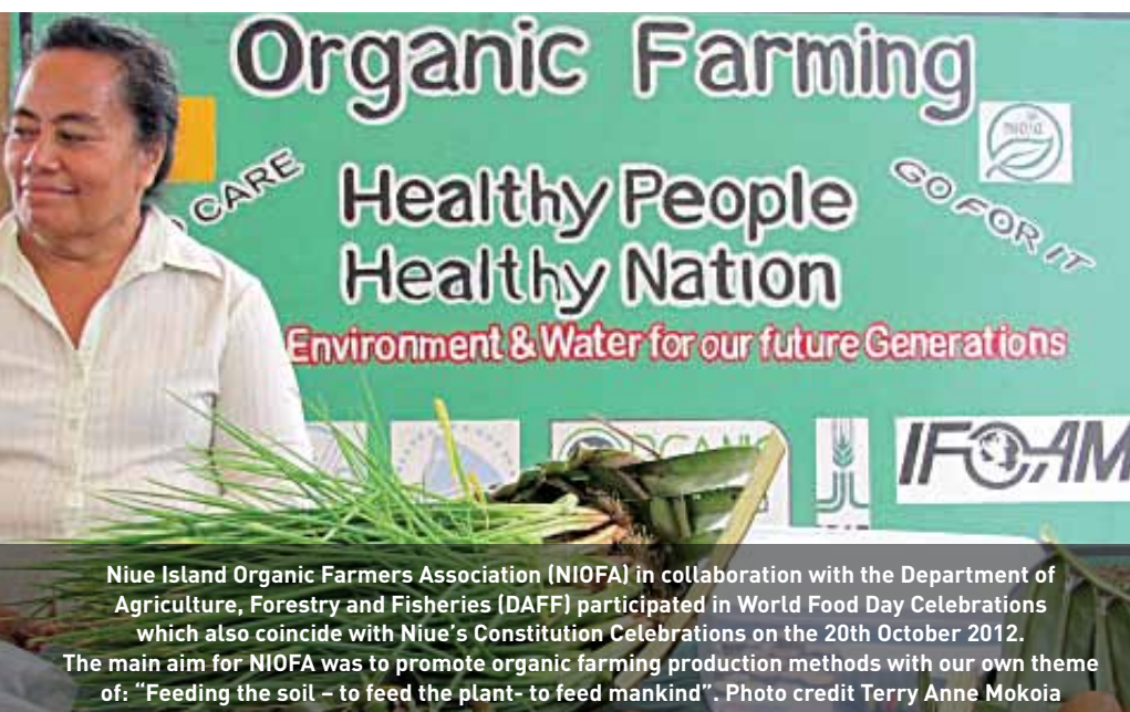
Niue Island Organic Farmers Association (NIOFA) in collaboration with the Department of Agriculture, Forestry and Fisheries (DAFF) participated in World Food Day Celebrations which also coincide with Niue’s Constitution Celebrations on the 20th October 2012. The main aim for NIOFA was to promote organic farming production methods with our own theme of: “Feeding the soil – to feed the plant- to feed mankind”.