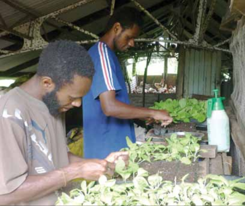
Youth Challenge Vanuatu Programme volunteers assisted with organic vegetable production trials during their 8 weeks placement with Farm Support Association.