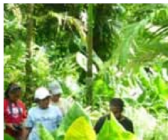
In 2012 Palau Organic Growers Association (POGA) has had planting materials sales and assisted implement Palau’s first farmer-chef alliance conference. Pictured are POGA members conducting one of their regular organic farm tours.