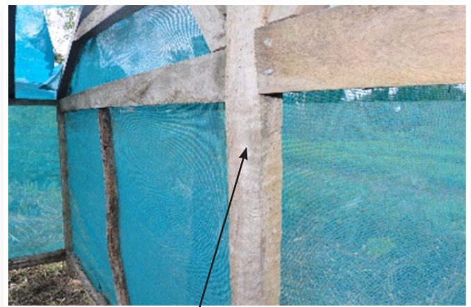
• Untreated wood