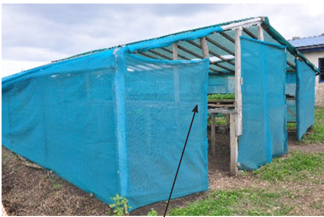
• Shade Cloth